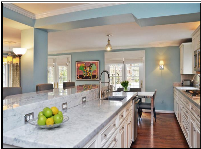
Gorgeous Carrara Marble Kitchen!