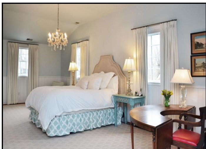
Spacious Master Bedroom with Vaulted Ceiling