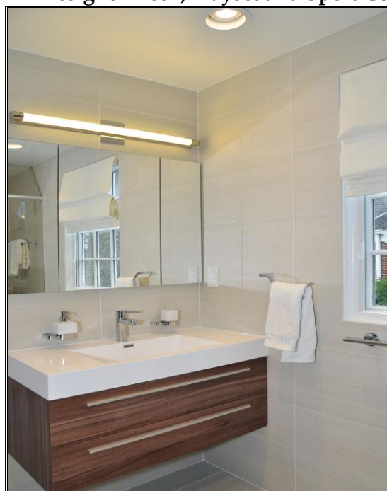
Stylish Renovated Master Bath!