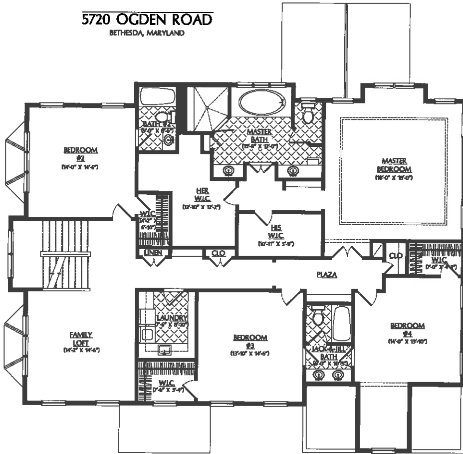
SECOND FLOOR PLAN AREA: 2,392 SF