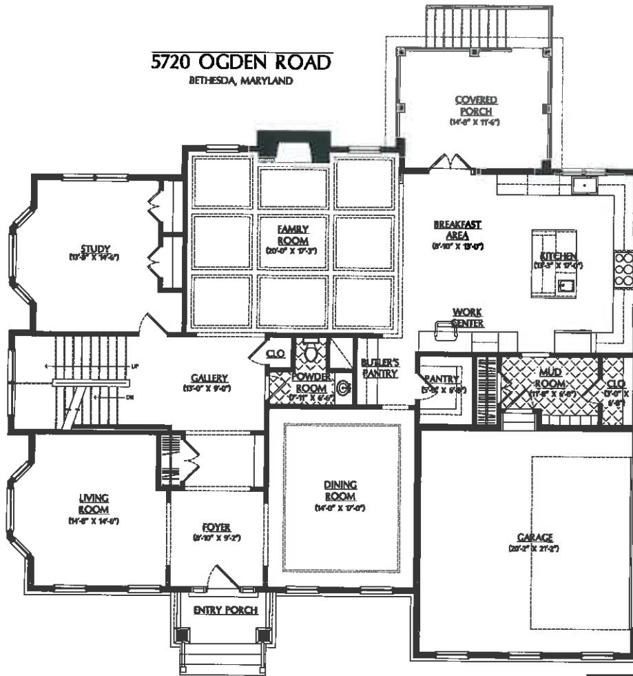
FIRST FLOOR PLAN AREA: 2,524 SF