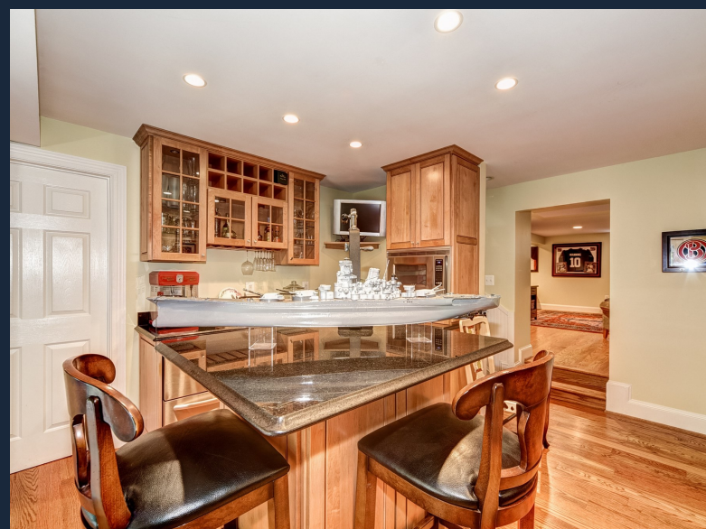
Lower Level Entertainment room